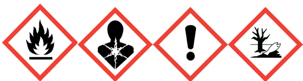
Flame Health Hazard Irritant Aquatic Hazard

Conforms to OSHA 29 CFR 1910.1200 and aligns with the United Nations Globally Harmonized System